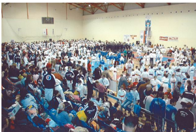
Golden Belt 2013