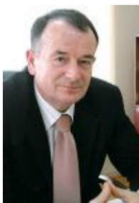
Co-President of OC Vojslav Ili Mayor of Cacak