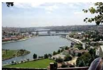
12 Taksim Square