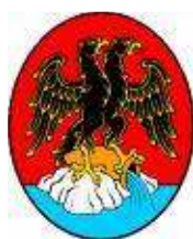
TOWN OF RIJEKA