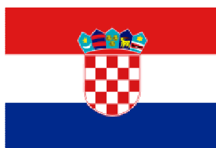
REPUBLIC OF CROATIA